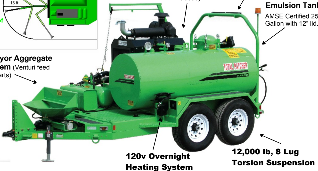
120v Overnight Heating System