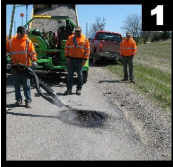
Apply Tack Coat