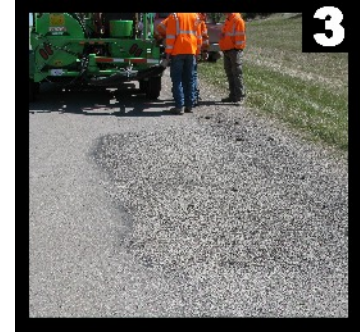
Cover With Dry Aggregate