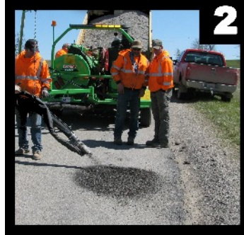
Inject Emulsion Aggregate Mixture